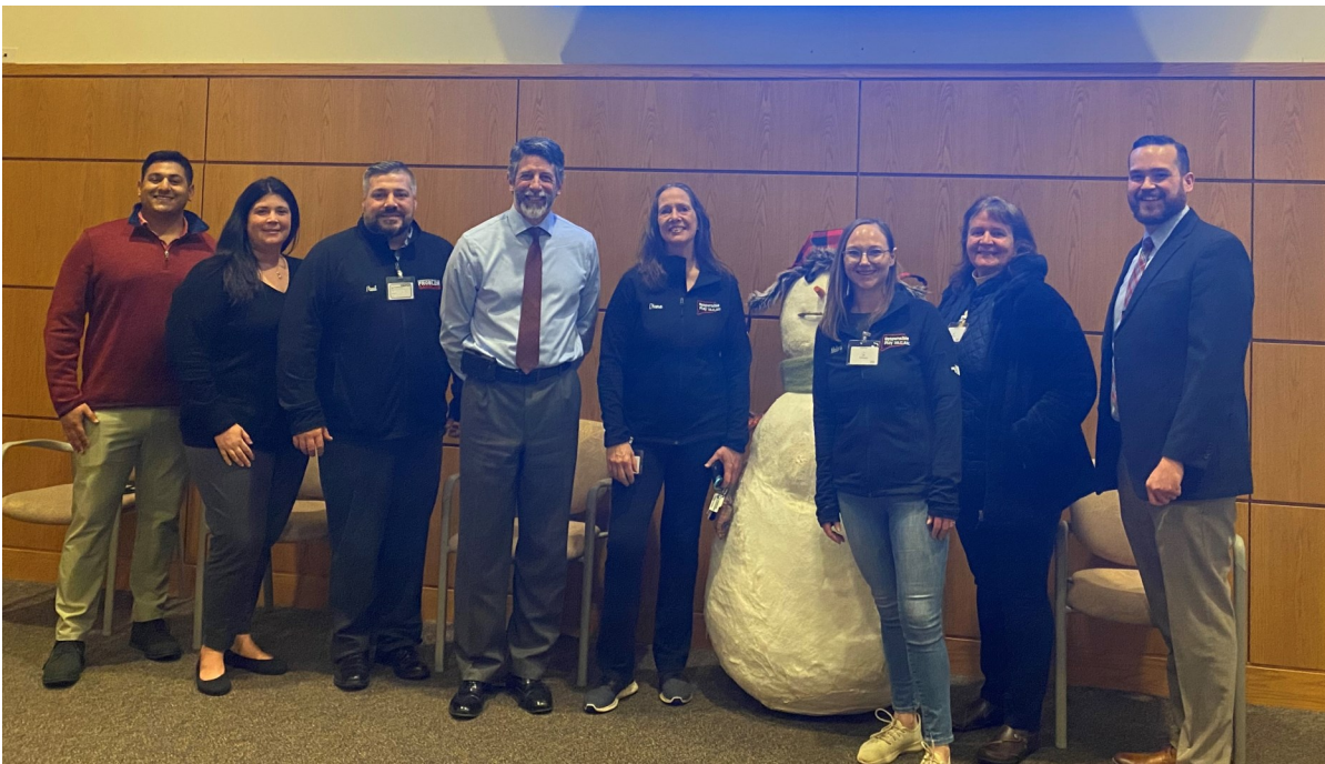
CCPG and DMHAS treatment providers visit Lottery Headquarters

CLC hosted a team of problem gambling treatment providers and counselors at Lottery headquarters on March 23 rd to discuss best practices and how our players in need can access the many services funded by CLC.